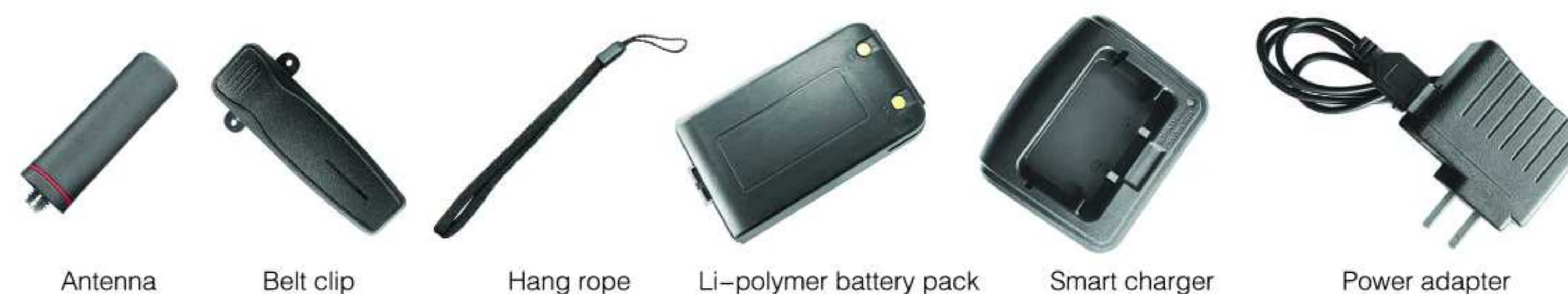
Antenna Belt clip Hang rope Li-polymer battery pack Smart charger Power adapter

ADDRESS:NO.13,ZIHUA STREET JIANGNAN HI-TECH INDUSTRIAL AREA NANHUAN RD,QUANZHOU,FUJIAN CHINA Web:www.tietong.hk